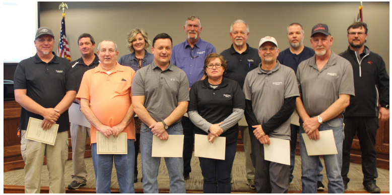
Dawson County Schools Facilities, Maintenance & Custodians