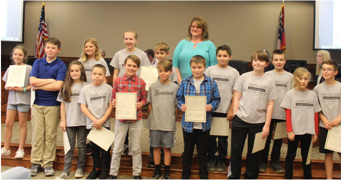
RES Perennial Math Recognition