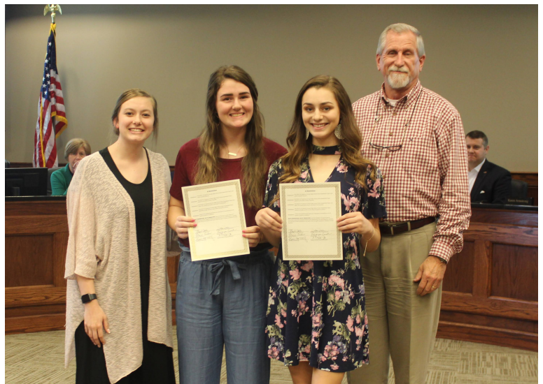
DCHS Girls Basketball