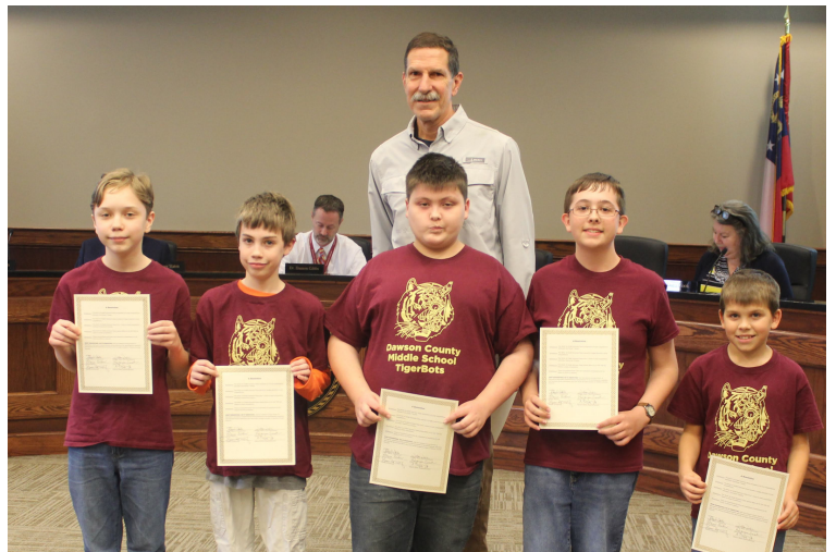
DCMS Robotics Team