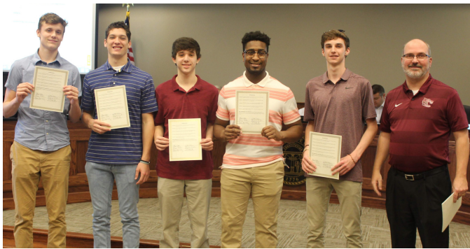
DCHS Boys Basketball